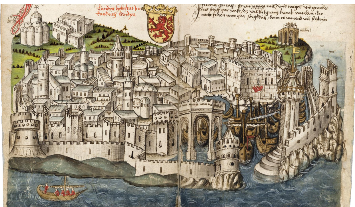
Image of late medieval Candia adapted from Karlsruhe, Badische Landesbibliothek, Cod. St. Peter 32, fol. 19v/20r. (https://digital.blb-karlsruhe.de/blbhs/content/pageview/3853546)